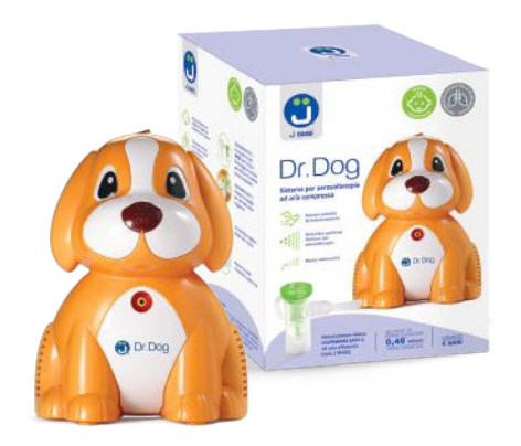
6-piece box Cod. 10780 DR. DOG ORANGE 8 P.P. €. 69,90