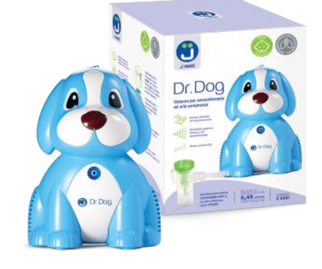
6-piece box Cod. 10778 DR. DOG BLUE P.P. €. 69,90