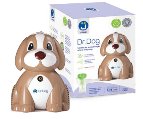
6-piece box Cod. 10781 DR. DOG BROWN P.P. €. 69,90